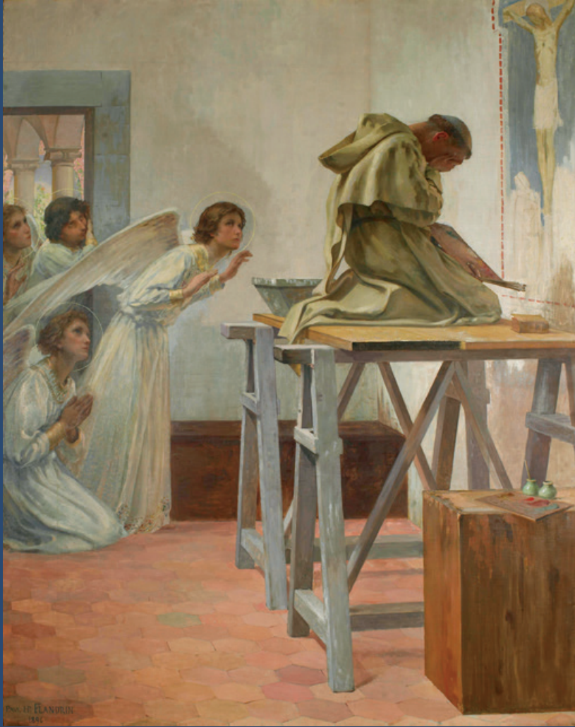
Fra Angelico Visited by the Angels, Paul Hippolyte Flandrin (1894).