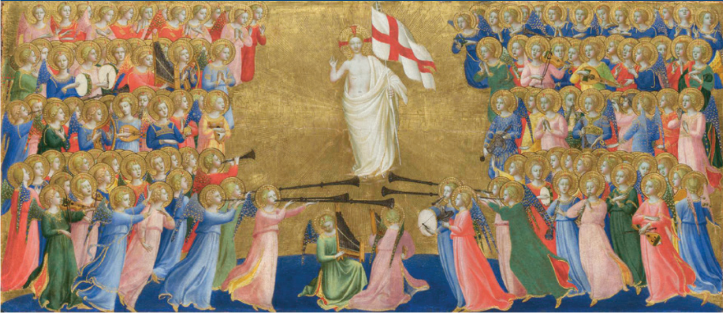
Christ Glorified in the Court of Heaven, Fra Angelico (1423-1424).

“Do not be amazed! You seek Jesus of Nazareth, the crucified. He has been raised.” —Mark 16:6