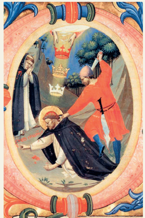
San Marco Missal 558 (Folio 41v), Fra Angelico (1430).

St. Peter Martyr, O.P., preacher of the true Faith and first canonized martyr of the Order of Preachers, wrote the beginning of the creed (Credo) on the ground with his own blood as he lay dying from the ax-blow of his assassin. His witness led to the conversion of his murderer, who became a Dominican friar himself.