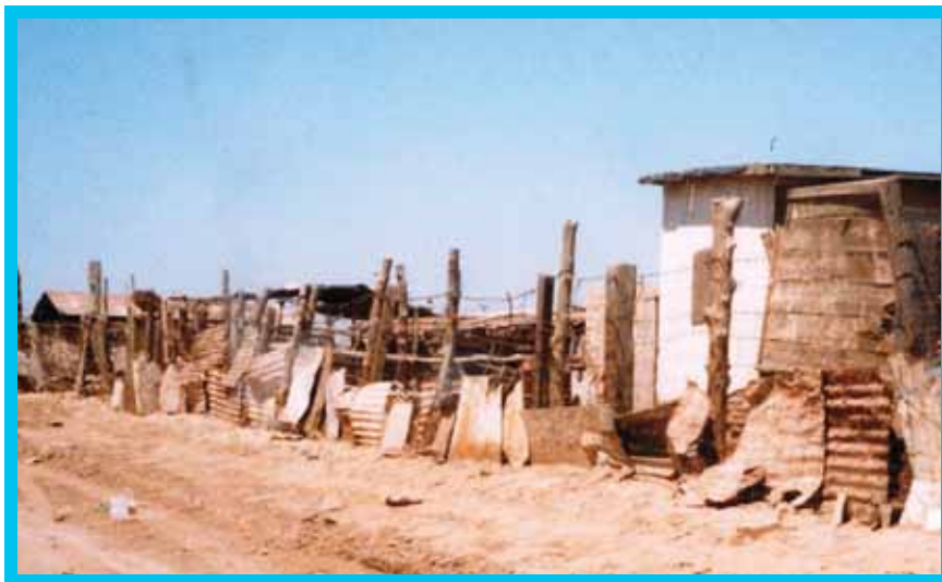
Cardboard houses still inhabited by the poorest in Mexicali.

parts, electricity is still a distant reality, and a barrel of water for drinking and washing is dropped off in front of each house every few days.