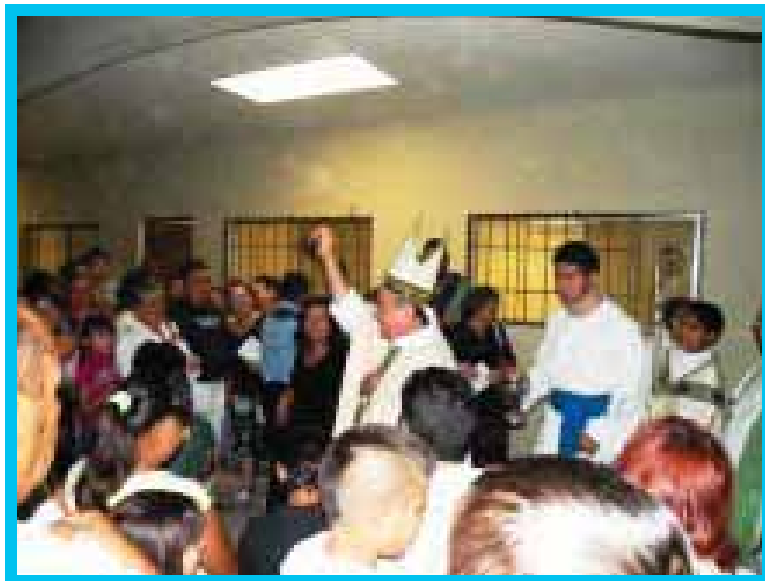
Bishop Macias blessing the new catechetical center.