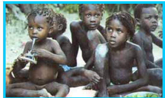
Haiti, even before the earthquake!