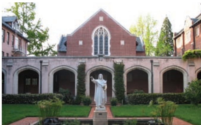
St. Albert the Great Priory cloister garden, Oakland, CA