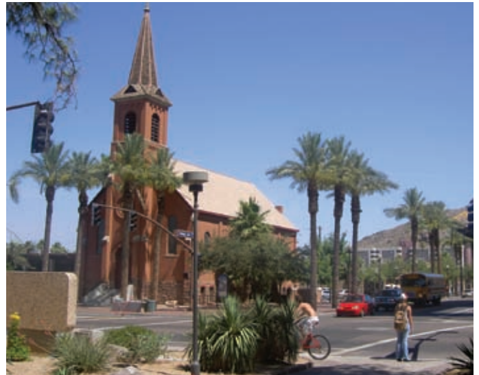
All Saints Catholic Newman Center in Tempe, Arizona

Today the friars of the Western Dominican Province minister to over 5,000 students at our 10 Newman Centers. For many students, college is the first time in their lives when they are free to choose or reject the "faith of their parents." In our ever