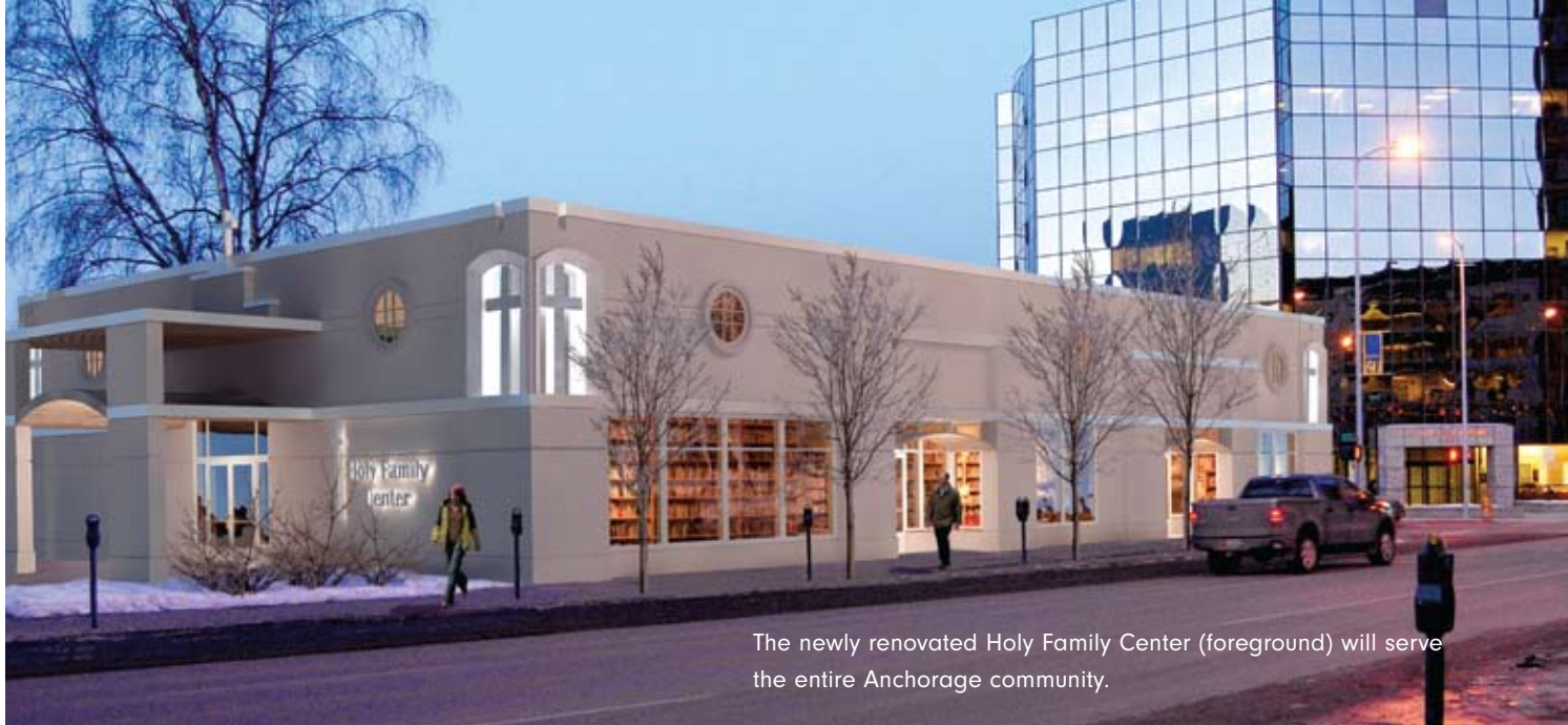
The newly renovated Holy Family Center (foreground) will serve the entire Anchorage community.