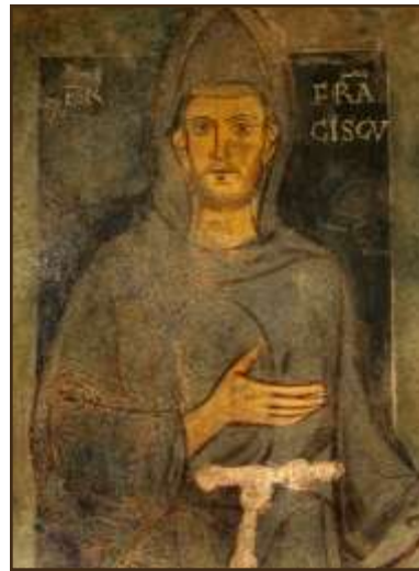
Oldest known depiction of Francis

Western Dominican Province 5877 Birch Court Oakland, California 94618 510-658-8722 opwest.org