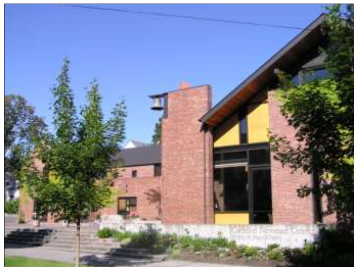
The Catholic Newman Center at the University of Washington is a ministry of Blessed Sacrament Parish.

For more information on the Catholic Newman Center at the University of Washington and its Veritas program, we invite you to visit our web page at uwnewman.org .