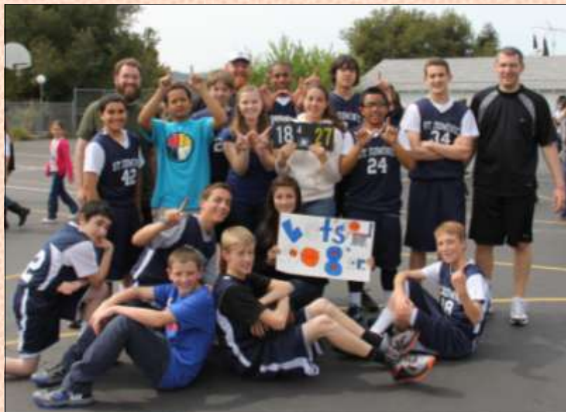
Students and Friars at St. Dominic School, Benicia, California

were encouraged to wear non-school-uniform blue and white clothing as school supporters or black and white clothing as Dominican supporters; interspersed throughout the crowd, of course, were those who judiciously wore blue and black clothing! It was a very exciting forty-five minutes, and each team held their own, but ultimately the Friars were victorious! The photo that I have attached shows the group at the end of the contest, with the cheerleaders serving as scorekeepers. I am happy to report that I am sending $650 via snail mail to the Mission West Campaign for Dominican Friars, the results of this wonderful community-building day. We are so very grateful for the Dominican presence on campus and at school events, and it is our pleasure to offer this gift to your campaign.