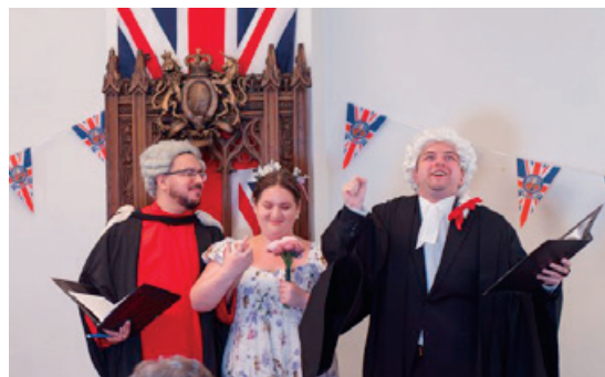
The parish schola cantorum performs Gilbert & Sullivan's "Trial by Jury."

In July, St. Dominic's schola cantorum performed an operetta. During the month