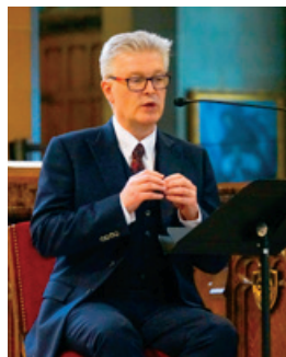
Sir James MacMillan, composer of a special jubilee motet, speaks at St. Dominic's.

Established in 1873, St. Dominic's in San Francisco began celebrating its long history with a presentation by Dr. Scott Hahn on "The Joy of Scripture" in April of 2023. The following month included an evening of worship featuring a talk by Scottish composer Sir James MacMillan in anticipation of his newly commissioned motet for the 150th Jubilee.