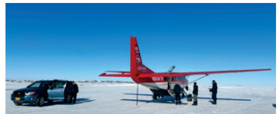
The film crew arrives by bush plane in the Village of St. Mary's on a frozen runway.