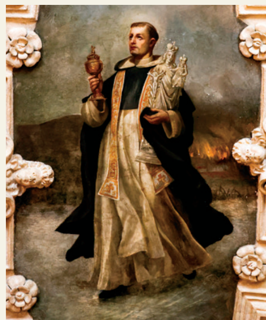
Fresco of St. Hyacinth from the sacristy ceiling of the Dominican Priory in Krakow.

During a Tartar invasion in Kyiv, St. Hyacinth went into the church to retrieve and protect the Blessed Sacrament from the invaders. When he did so, he heard a woman's voice saying: "My son, will you leave me behind?" St. Hyacinth, understanding this to be the voice of the Blessed Mother, lifted the massive alabaster statue of Mary, far exceeding what he could normally lift, and carried both the statue and the Blessed Sacrament to safety.