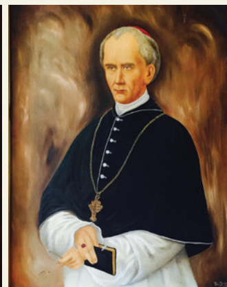
Archbishop Joseph Alemany, O.P.