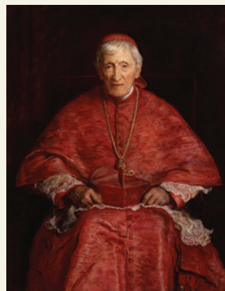
St. John Henry Cardinal Newman

Fittingly, the Western Dominican Province launched the first Dominican-run—and fifth oldest—Newman Center in the U.S., establishing it at the University of Washington in 1908.