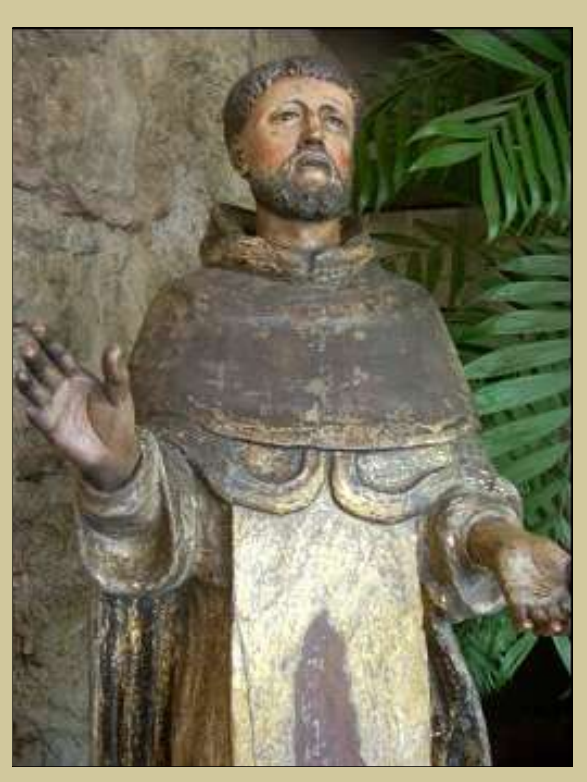
Santo Domingo, Antigua, Guatemala

Non-Profit Organization US Postage PAID Seattle, WA Permit # 4037