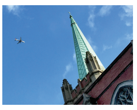
Blessed Sacrament's spire guides pilots to Sea-Tac airport.

Though Blessed Sacrament's spire isn't critical to the pilots (they have other