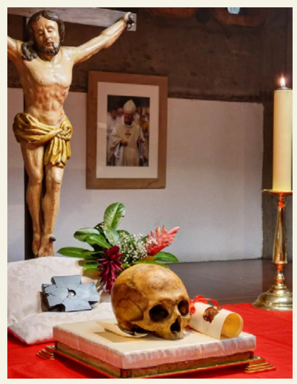
The skull and other relics of St. Thomas Aquinas were unveiled for the 700th anniversary of his canonization at the Dominican Convent of Toulouse, France.

The Dominicans are currently celebrating the triple jubilee of St. Thomas Aquinas! This year marks the 700th anniversary of the canonization of Aguinas (July 18). In 2024, we commemorate the 750th jubilee of Aquinas' death (March 7). And in 2025, we commemorate the 800th anniversary of his birth (January 28). This triple jubilee celebration is an opportunity for many blessings. As such, the Holy See has granted a plenary indulgence "to the properly disposed faithful who will participate in the Eucharistic celebrations organized by the Dominican Family in our churches and schools on the important occasions of the jubilee of the canonization and death of St. Thomas Aguinas, and to the faithful who will make pilgrimages to Churches, shrines and oratories under his patronage." This triple jubilee and the indulgences associated with it run from now through 28 January 2025.